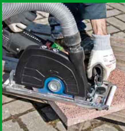
Artificial stone – terrace slabs here: dry cutting