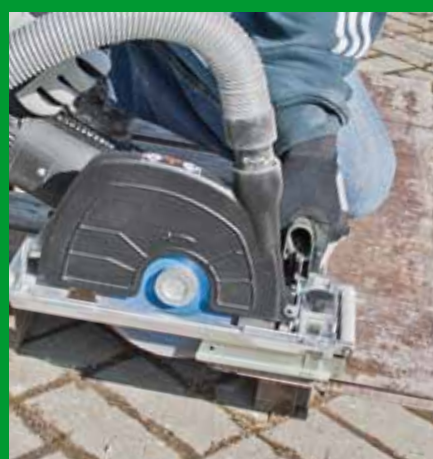
Concrete curbs in gardening and landscaping here: dry cutting