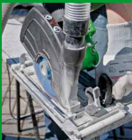
Natural stone window sills – milling of joints here: dry cutting with depth limiting